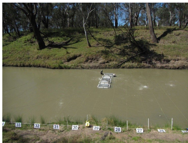
Scientists measuring methane gas using rising chambers from Condamine River